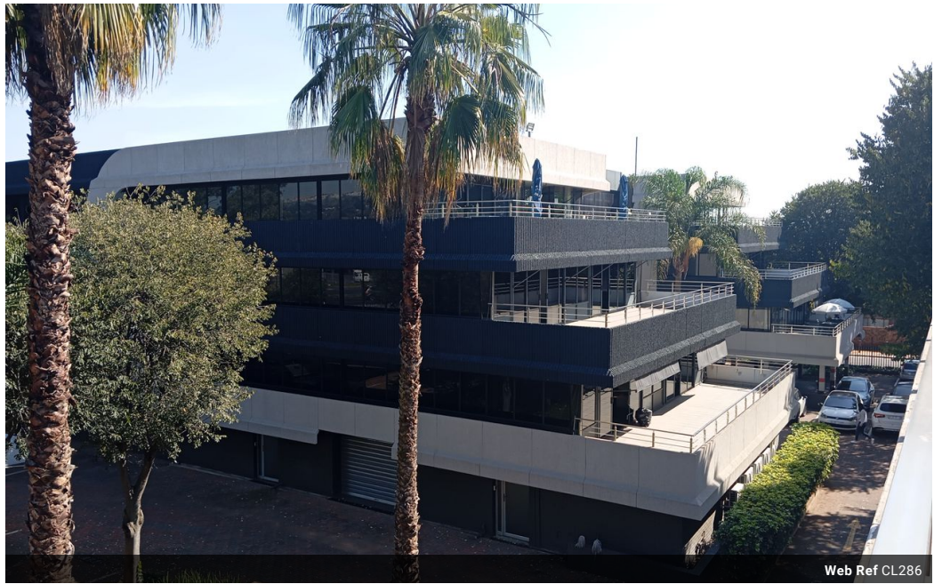
Web Ref CL286

Thornhill Office Park, Building 10 84 Bekker Rd, Vorna Valley Midrand, Gauteng, 1686