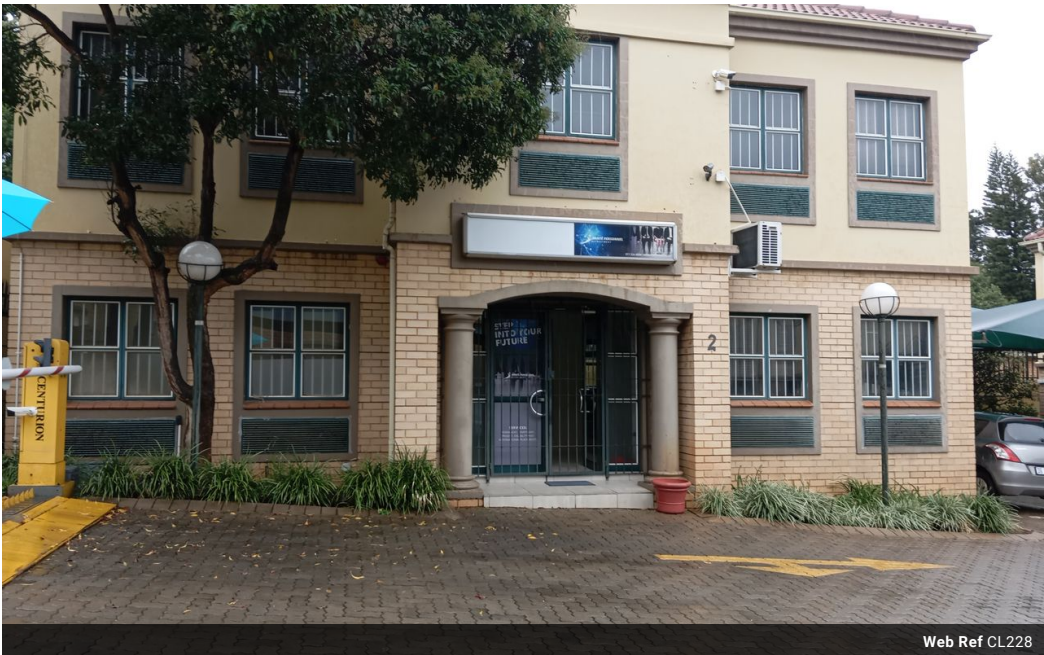
Web Ref CL228

Thornhill Office Park, Building 10 84 Bekker Rd, Vorna Valley Midrand, Gauteng, 1686