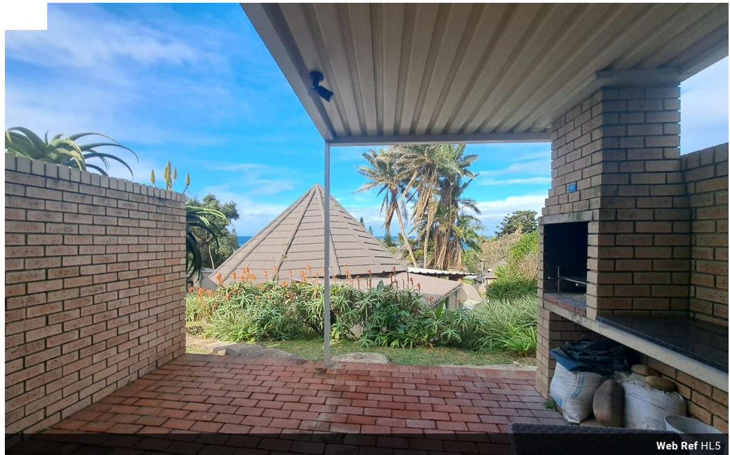
Web Ref HL5

Thornhill Office Park, Building 10 84 Bekker Rd, Vorna Valley Midrand, Gauteng, 1686