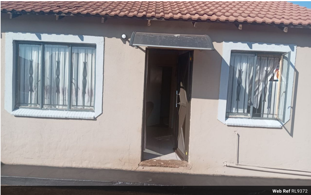
Web Ref RL9372

Thornhill Office Park, Building 10 84 Bekker Rd, Vorna Valley Midrand, Gauteng, 1686