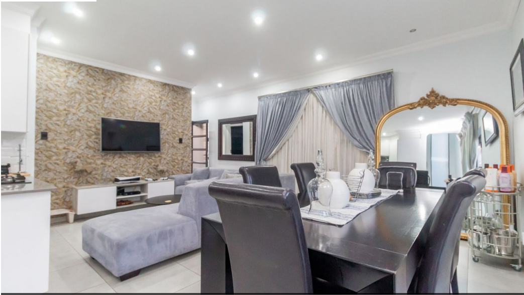
ON SHOW Web Ref RL9692