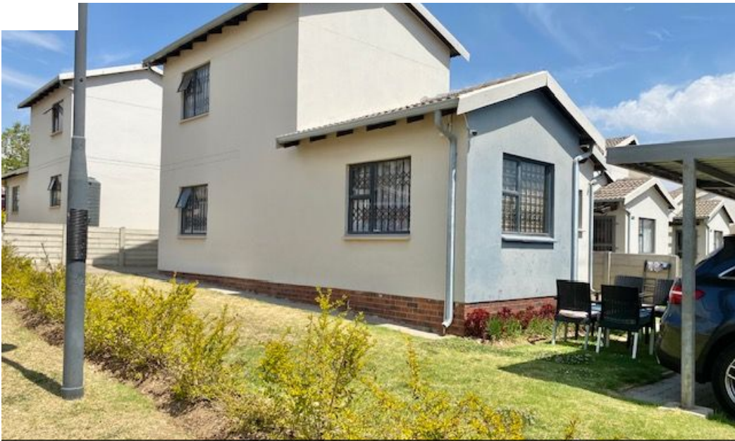
ON SHOW, SOLE MANDATE Web Ref RL7787