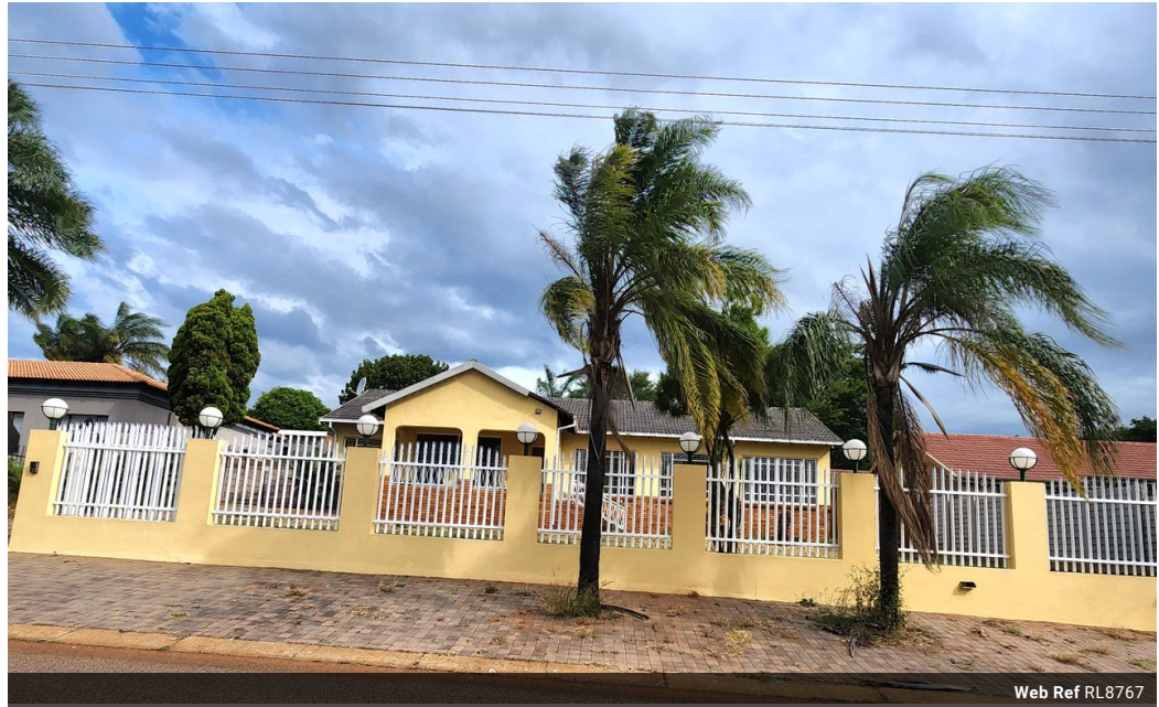
Web Ref RL8767

Thornhill Office Park Building 10 84 Bekker Rd Vorna Valley Midrand 1686