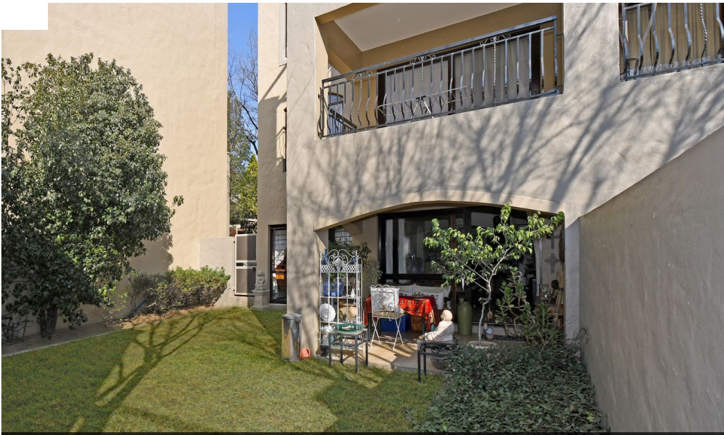
SOLE MANDATE Web Ref RL9288

Thornhill Office Park, Building 10 84 Bekker Rd, Vorna Valley Midrand, Gauteng, 1686