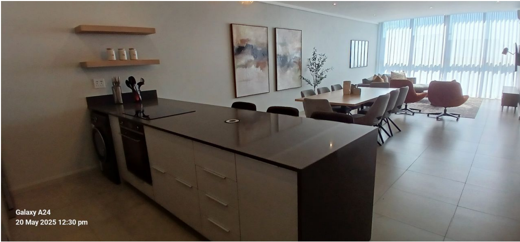
Galaxy A24 20 May 2025 12:30 pm

Thornhill Office Park, Building 10 84 Bekker Rd, Vorna Valley Midrand, Gauteng, 1686