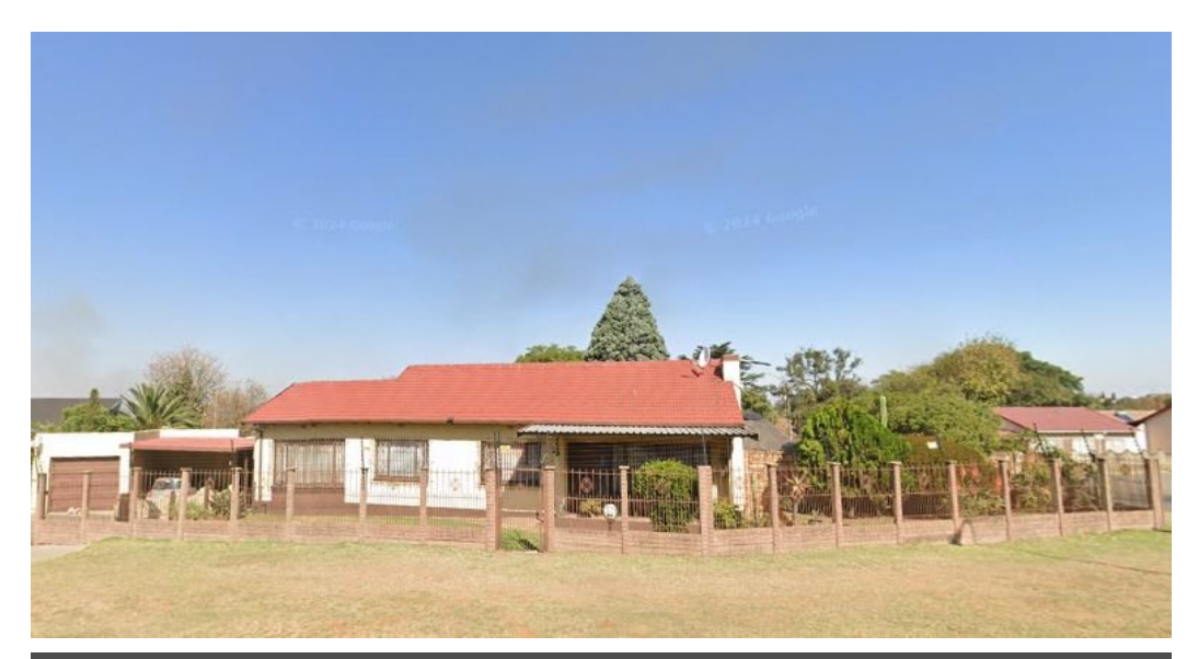
Web Ref RL9784