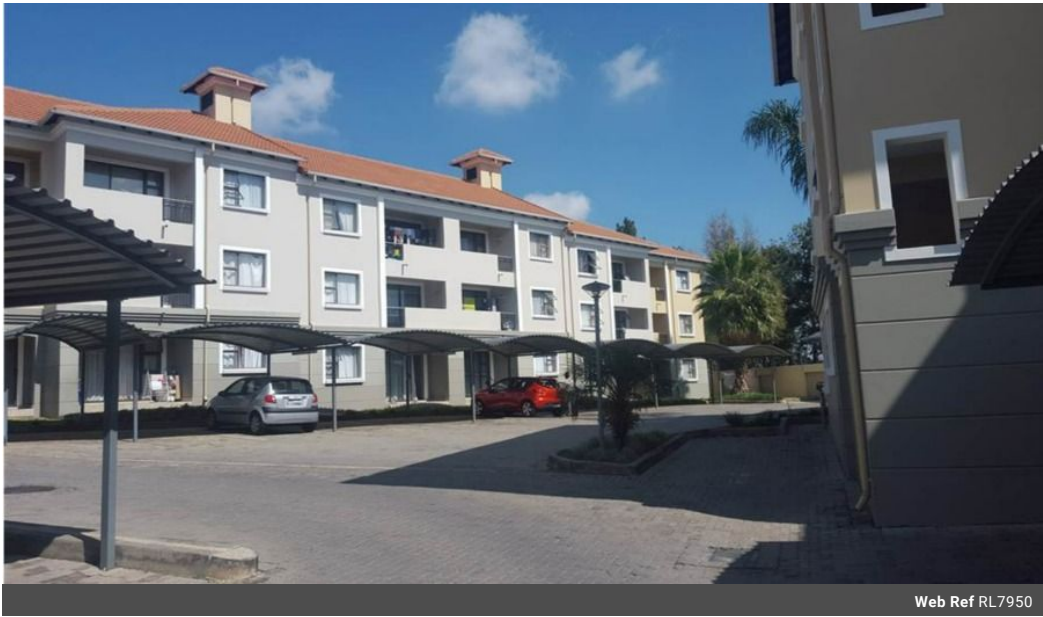
Web Ref RL7950

Thornhill Office Park, Building 10 84 Bekker Rd, Vorna Valley Midrand, Gauteng, 1686