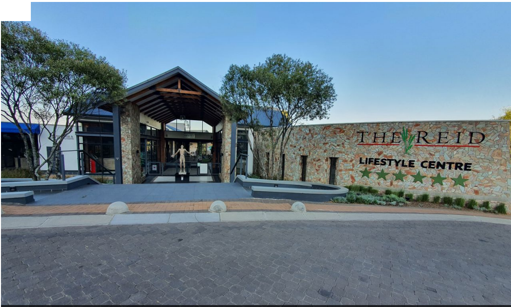
SOLE MANDATE Web Ref RL9028

Thornhill Office Park Building 10 84 Bekker Rd Vorna Valley Midrand 1686