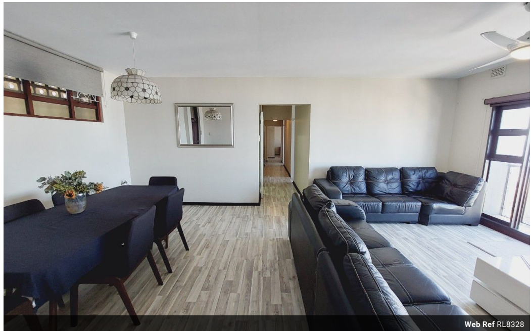
Web Ref RL8328

Thornhill Office Park, Building 10 84 Bekker Rd, Vorna Valley Midrand, Gauteng, 1686